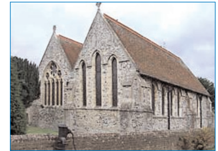
St Bartholomew's Hospital