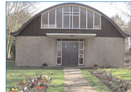
St Andrew's Roman Catholic Church