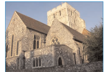
St Clement's Church

Since Roman times, Sandwich has been a place for visitors, often marking their point of entry into Britain. The town has a rich history which has influenced both the lives of its inhabitants and the nation. The earliest recorded Christian arrival is that of Wilfred, Bishop of Northumberland in 664AD. Over the centuries, the town has been a place for those seeking sanctuary, with Thomas a Becket, Richard the Lionheart and the Huguenots all seeking a place of safe haven and rest here. The eight destinations on the tour will take you on a journey which explores the Town's spiritual history, in the places where pilgrims past, present and future have found, and continue to find, inspiration and revelation.