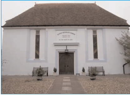
United Reformed Church