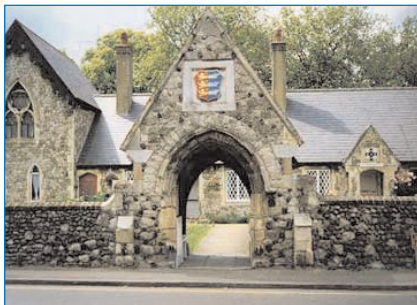
St Thomas' Hospital