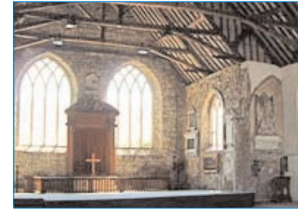
St Mary's Church