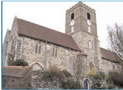
St Peter's Church